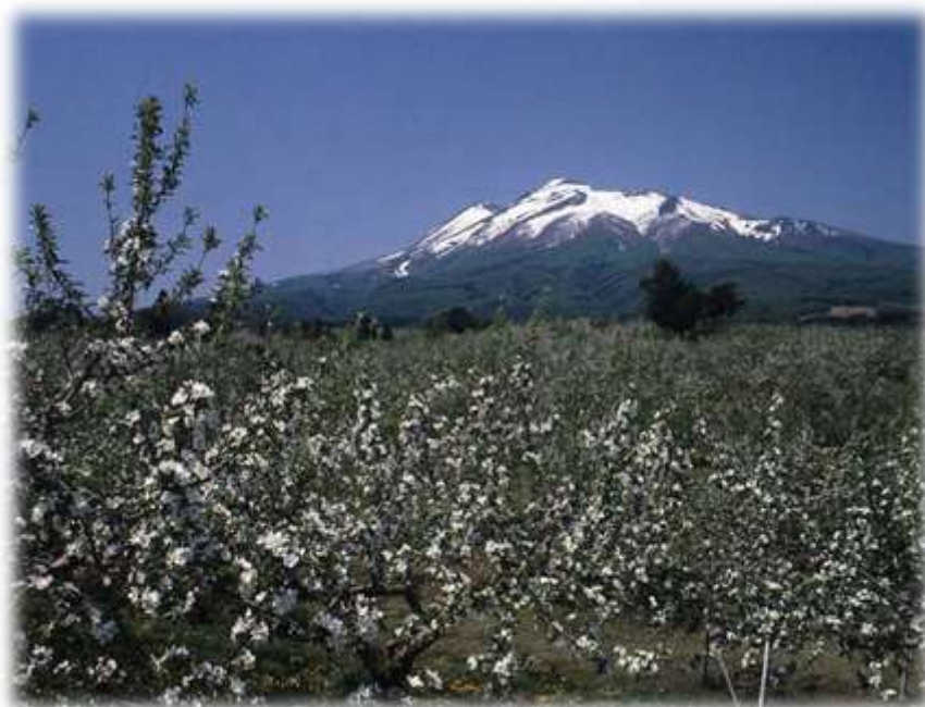
Mt. Iwaki, seen from an apple orchard at the foot of the mountain.

Mt. Iwaki is one of the best 100 mountains in Japan and the highest mountain in Aomori (1,625m), called Tsugaru-Fuji. Rockwood Hotel & Spa is situated at the foot of Mt. Iwaki. The hotel was named after Iwaki which exactly means Rock and Wood. The mountain has several trails, from easy ones to strenuous ones, appealing to all levels of trekkers.